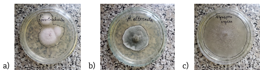
Figure 1. Phytopathogenic micromycetes

The studies used identified and classified strains of dominant microorganisms – Bacillus methylotrophicus 10 and Phyllobacterium ifriqiyense 1 (GenBank MK947056, MK947049). Strains of phytopathogenic micromycetes Fusarium sporotrichioides Sherb. 23.2, Alternaria alternata (Fr.) Keissl. 3.45, Nigrospora oryzae (Berk. & Broome) Petch 18.77 (Fig.1) were provided from the collections of the Plant Biochemistry and Bioenergetics V.F. Peresyphkin Department of Phytopathology of the National University of Life and Environmental Sciences Of Ukraine.